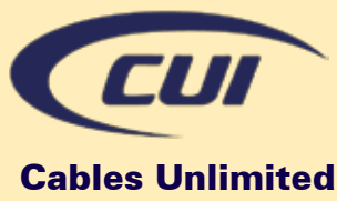
Fiber to the Antenna

RF Industries now offers custom cable assemblies through newly acquired Cables Unlimited . Cables Unlimited is part of the Corning Connections Gold Program, which designates high quality and an exclusive 25 year warranty.