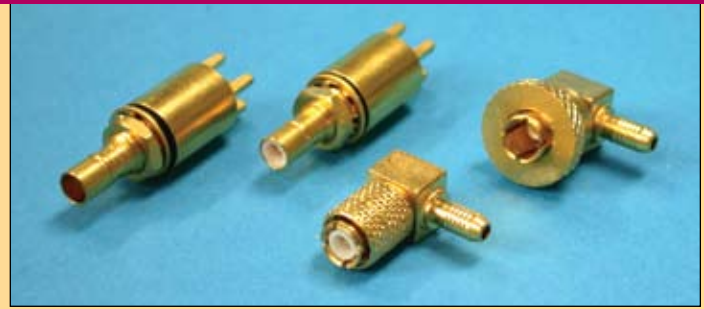
Unique SMB connectors developed for the military to meet specific connection and environmental requirements.

Finally, we had one more issue to solve for them and this solution was not in any physics books. Our customer's concern was that their technicians could accidentally mismatch the input and output