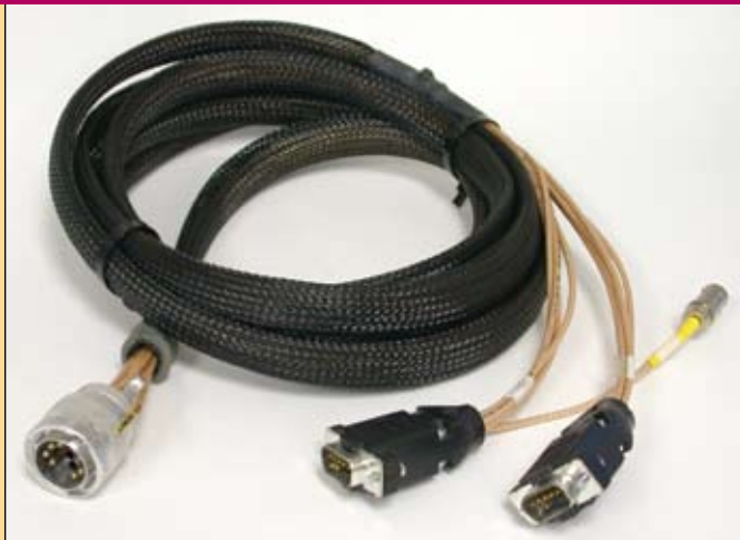
One of our custom cable assemblies.