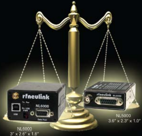
NL6000 3" x 2.6" x 1.6"