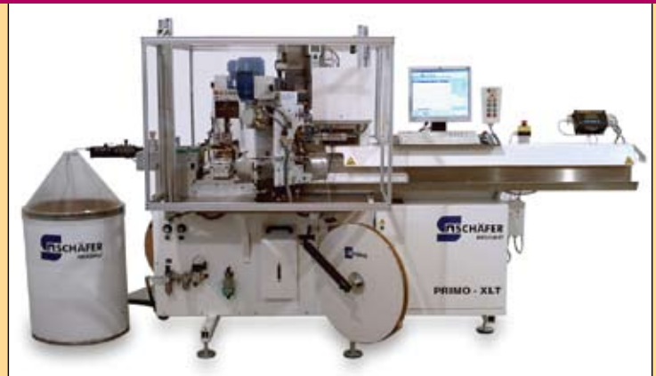
The Schäfer Megomat Primo XLT wire processing machine